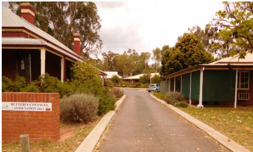
Butterly Cottages Association, Toodyay. Butterly House (c1870) is to the left.

Heeding the call for members to share current projects they are working on, I can report that I have been commissioned to assist Toodyay's Butterly Cottages Association to produce a booklet for the official opening of their new group of homes for the aged. This will take place in mid-July if all goes to plan.