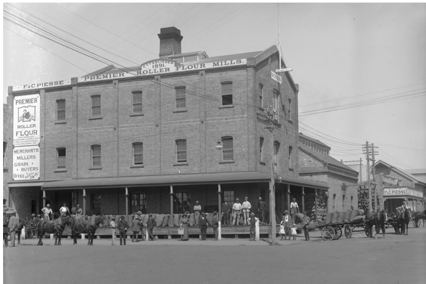
The Premier Roller Mill, Katanning, 1912.

The Dome Café in Katanning was opened for business on 30 April this year. Housed inside the Premier Mill, the café opened 127 years to the day after the Mill first opened in 1891. Although its purpose has dramatically changed, the revitalisation followed a pattern of adaptive re-use that allowed the Mill to survive and retain its value in the community.